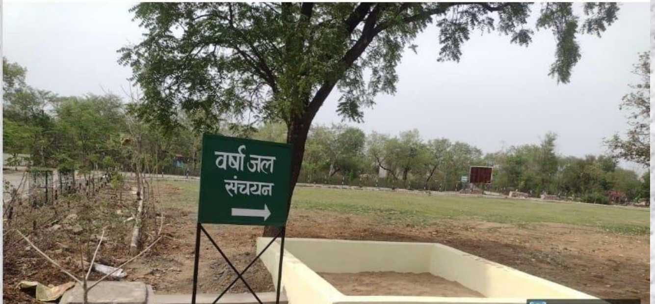
a. Rain Water Harvesting APSU Rewa for storing water in a pond or tank