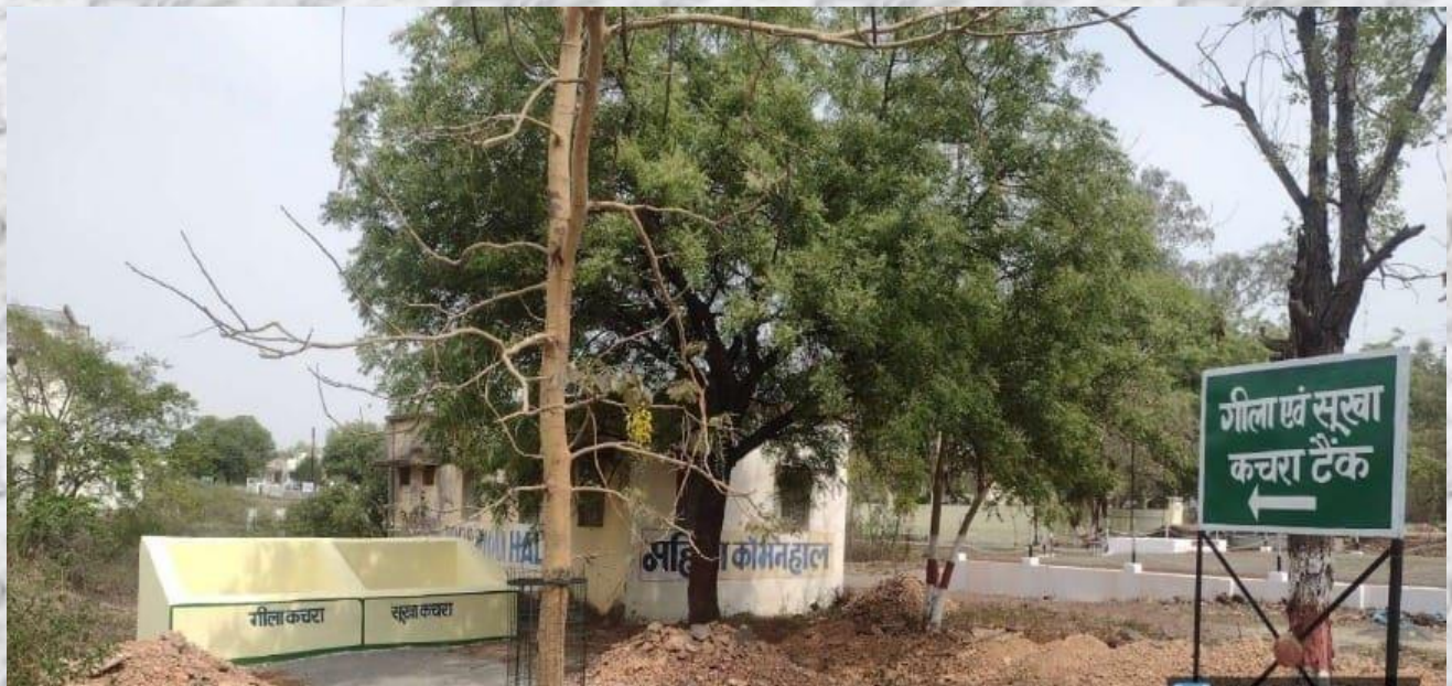
b. Dry and Wet waste tank in APSU for storage of dry waste and wet waste under Cleanliness (as a part of collaborative activity Nagar Nigam Rewa)