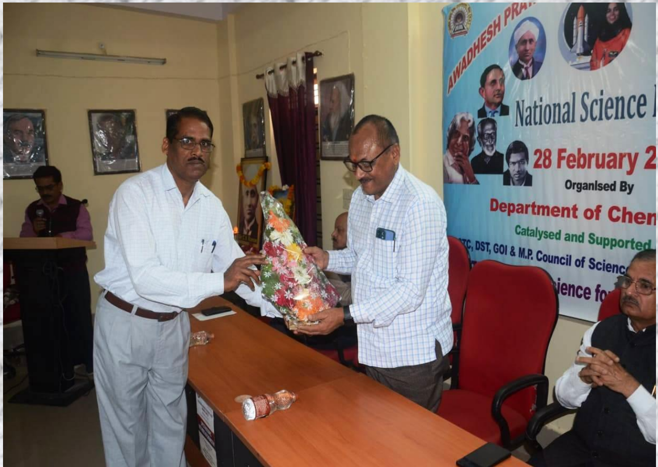
National Science Day celebration, under canopy of MPCST and Chemistry Department

Collaborative activity under MoU with MPCST, Bhopal